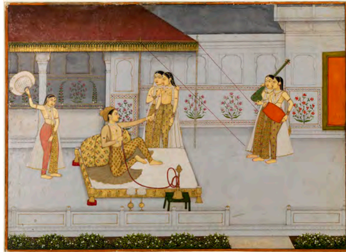
Unknown (North India, Mughal) A Prince with Ladies on a Terrace , ca. 1735 opaque watercolor on paper, heightened with gold 9 1/2 x 13 5/16 in. Bequest of Mrs. Horace W. Frost 91.15.36

The setting of a painting can play an important role in creating a mood and telling story. Take a look at these artworks and discuss the role played in each by the setting: