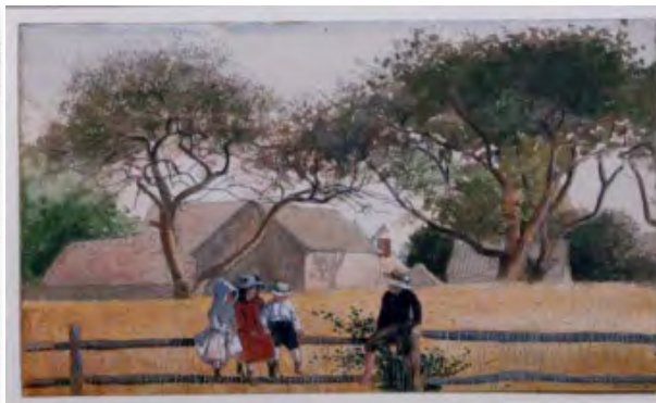
Winslow Homer (American, 1836–1910) Children on a Fence , 1874 watercolor over pencil on paper 7 3/16 x 11 7/8 in. 41.2