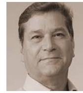
Law & Arbitration