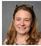
Networks & Congestion