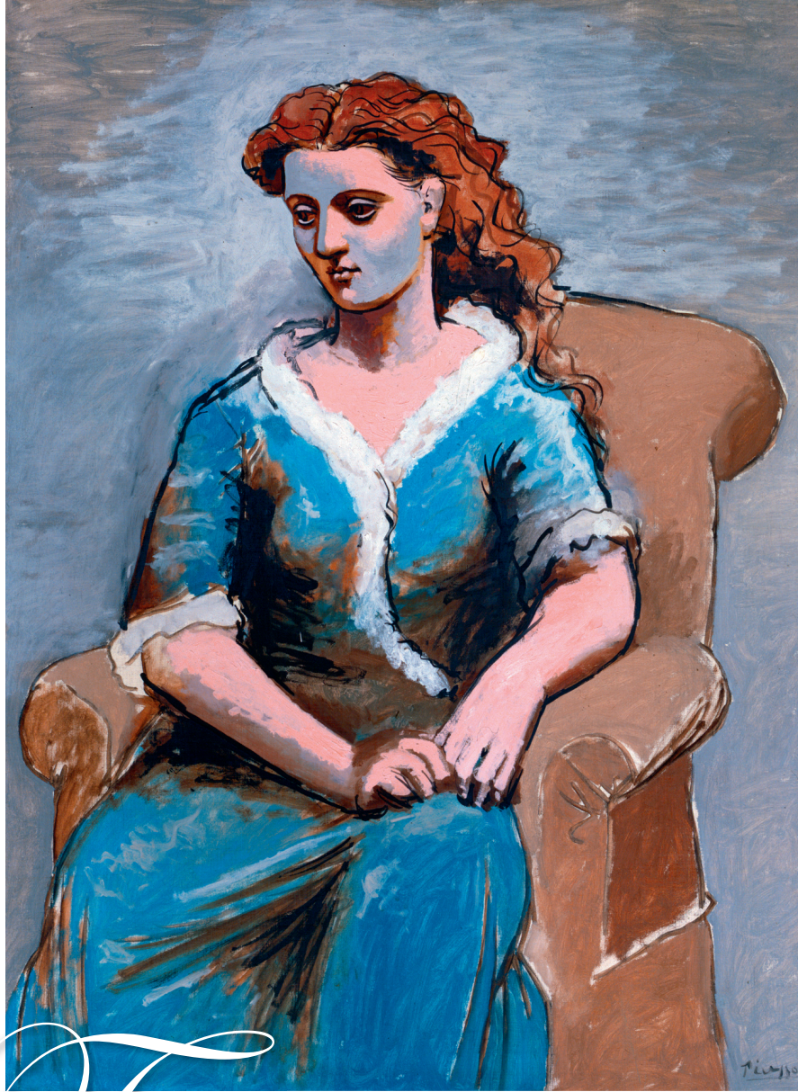
Left: Whether Sara served as Picasso's muse when he painted Woman Seated in an Armchair is the subject of debate among scholars, but Picasso's idealized view of womanhood certainly owed a debt to his friend and neighbor, Mrs. Murphy.