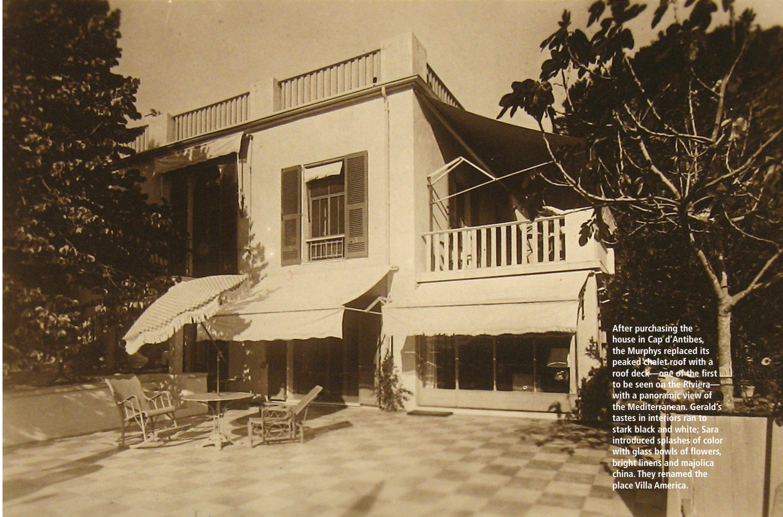
After purchasing the house in Cap d'Antibes, the Murphys replaced its peaked chalet roof with a roof deck—one of the first to be seen on the Riviera—with a panoramic view of the Mediterranean. Gerald's tastes in interiors ran to stark black and white; Sara introduced splashes of color with glass bowls of flowers, bright linens and majolica china. They renamed the place Villa America.