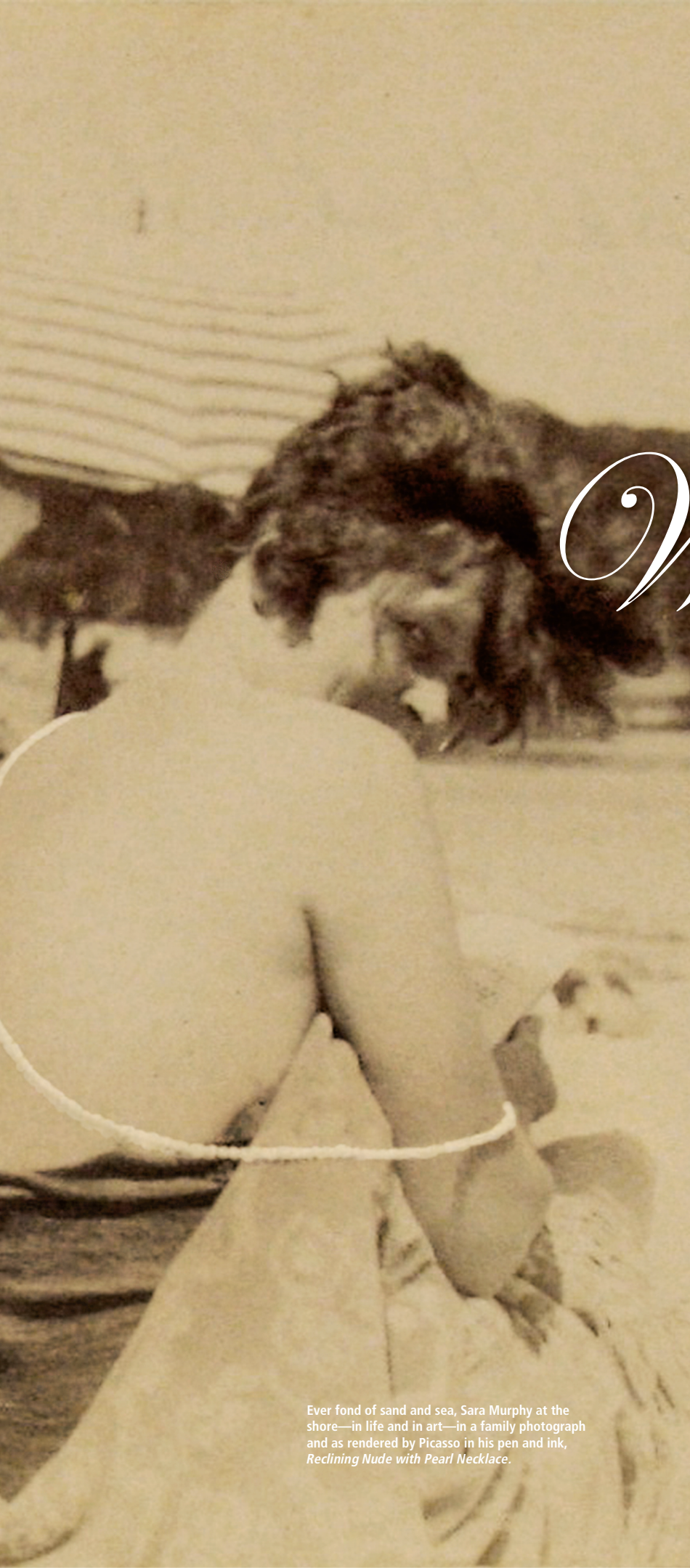
Ever fond of sand and sea, Sara Murphy at the shore—in life and in art—in a family photograph and as rendered by Picasso in his pen and ink, Reclining Nude with Pearl Necklace .