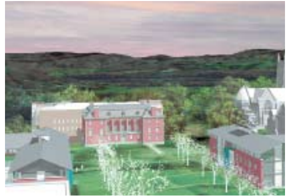
Bohlin Cywinski Jackson