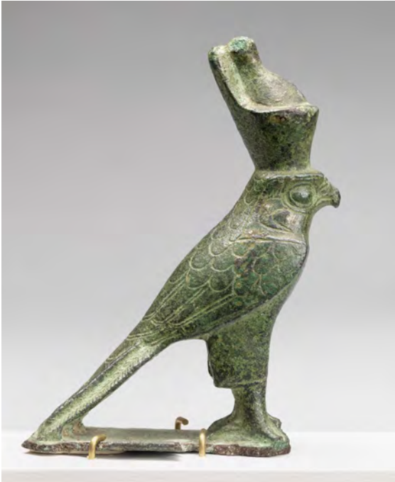
Unknown (Egyptian) Horus date unknown bronze Overall: 4 x 2 15/16 in. (10.2 x 7.5 cm) Base: 1 9/16 x 3 7/16 x 2 in. (3.9 x 8.7 x 5.1 cm) Gift of Horace Mayer 60.36.4