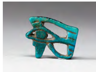
Sacred eye amulet date unknown faience; 9/16 x 11/16 in., 1/8 in. (1.5 x 1.8 cm, 0.3 cm). Gift of Horace Mayer (60.39.2.E)