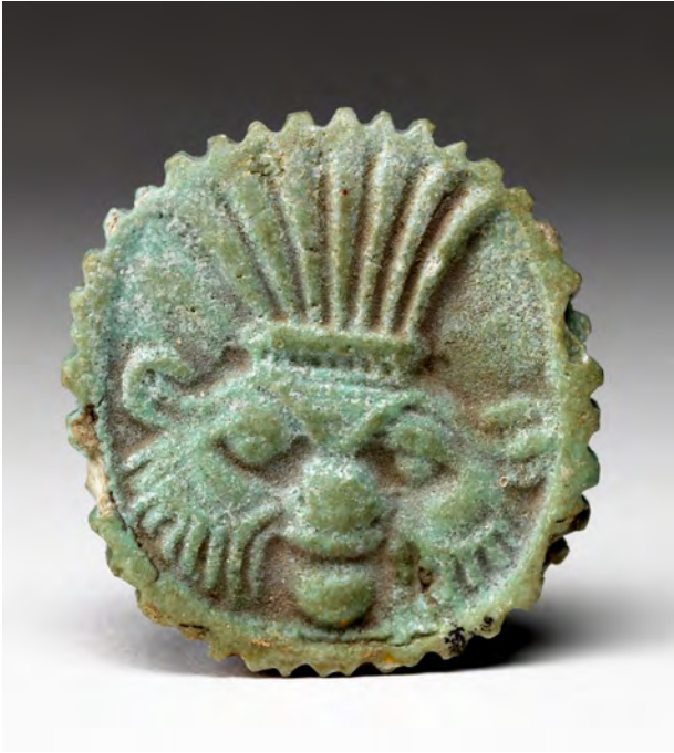
Unknown (Egyptian) Amulet date unknown faience 1 3/8 x 1/4 in. (3.5 x 0.6 cm) Gift of Horace Mayer 61.19.1.G