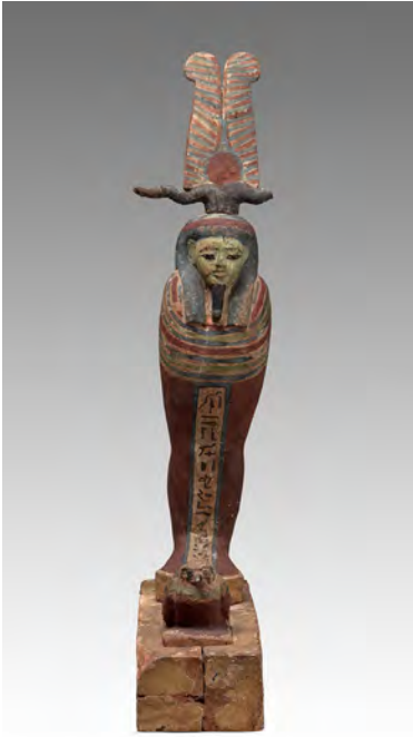
Unknown (Egyptian) Ptah-Sokar with bird , no date painted wood 21 3/4 in. (55.3 cm) Anonymous gift 93.1.103