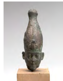
Head of Osiris 26th Dynasty (664–525 B.C.) bronze; 1/2 x 7/8 in. (6.3 x 2.2 cm). Gift of Horace Mayer (59.21.22)